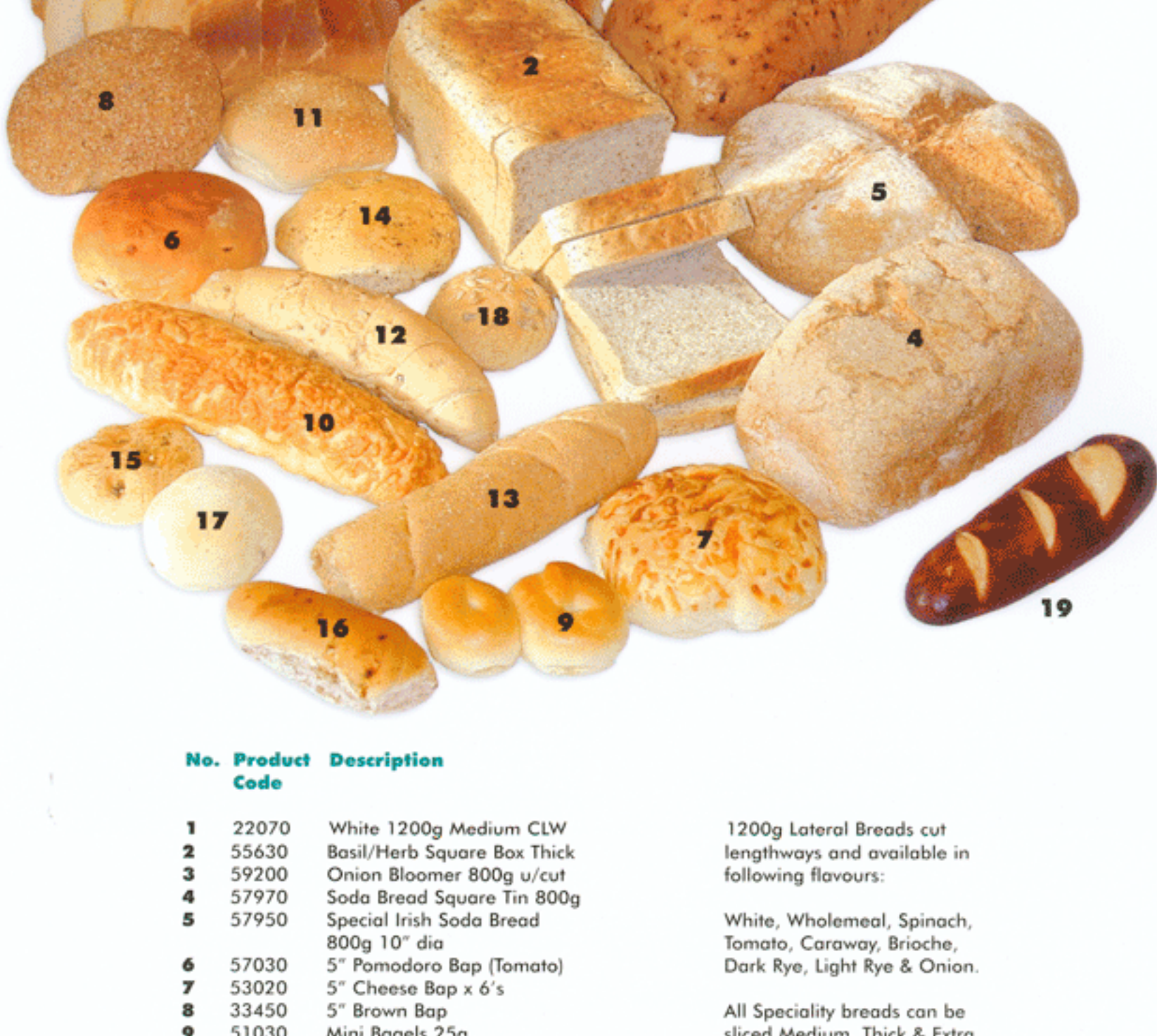
No. Product Description Code