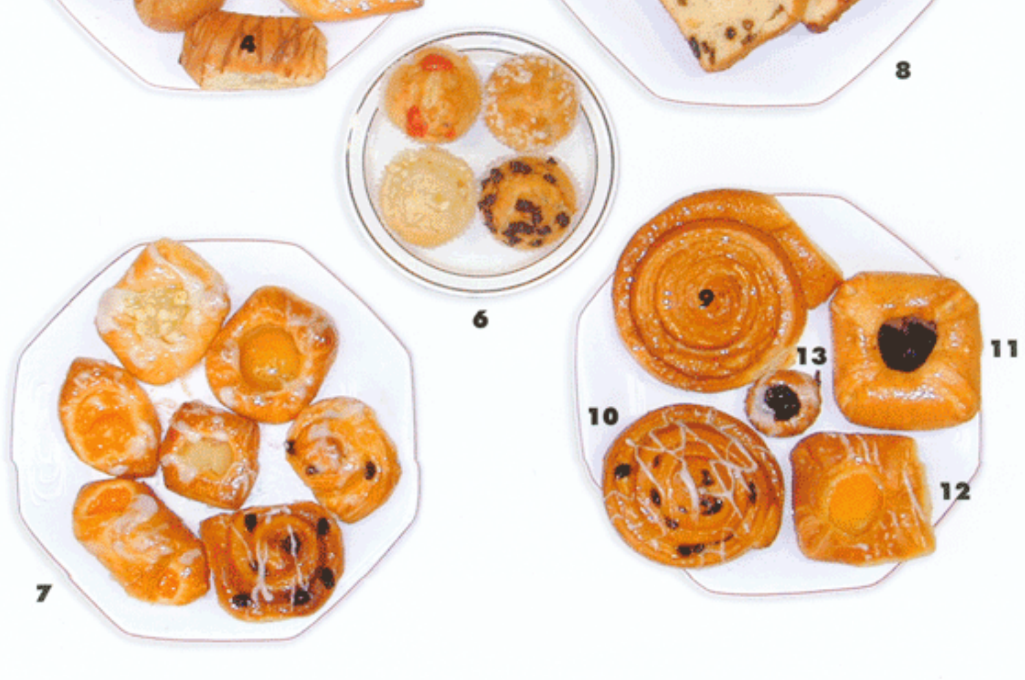
No. Product Description Code

35g Italian Selection Dinner Rolls are light baked and can be baked off at 220 oC for 3 minutes to give a nice fresh crusty roll.