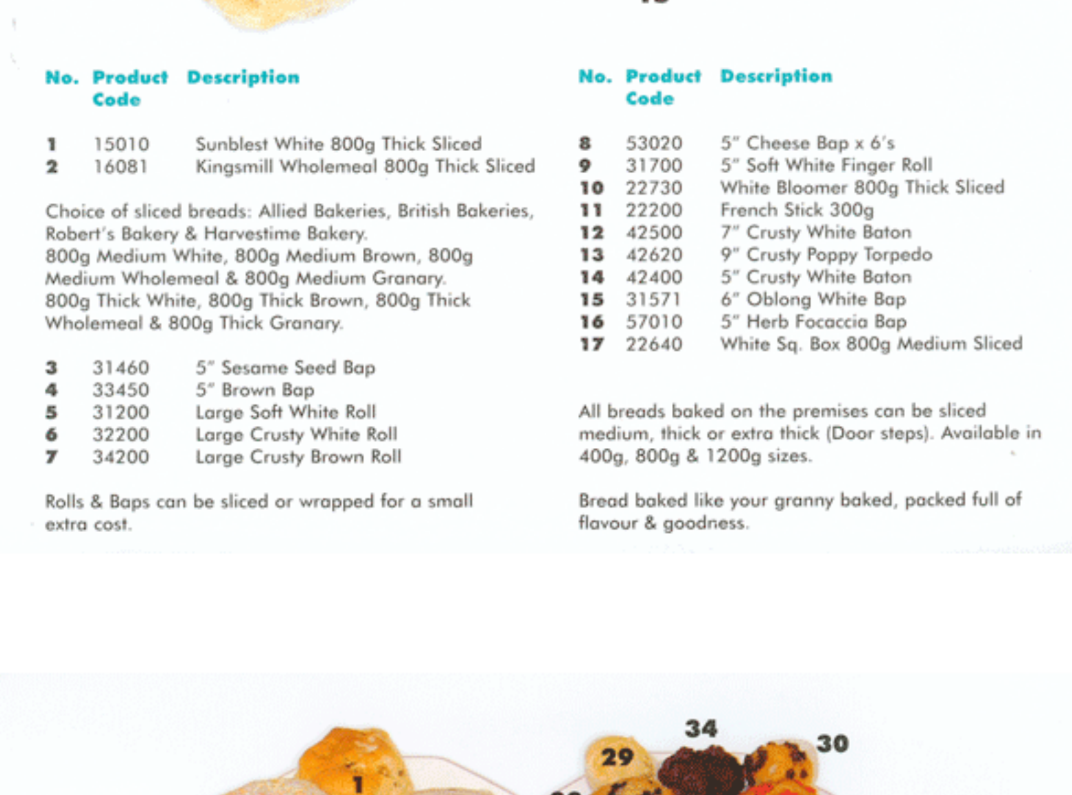
No. Product Description Code