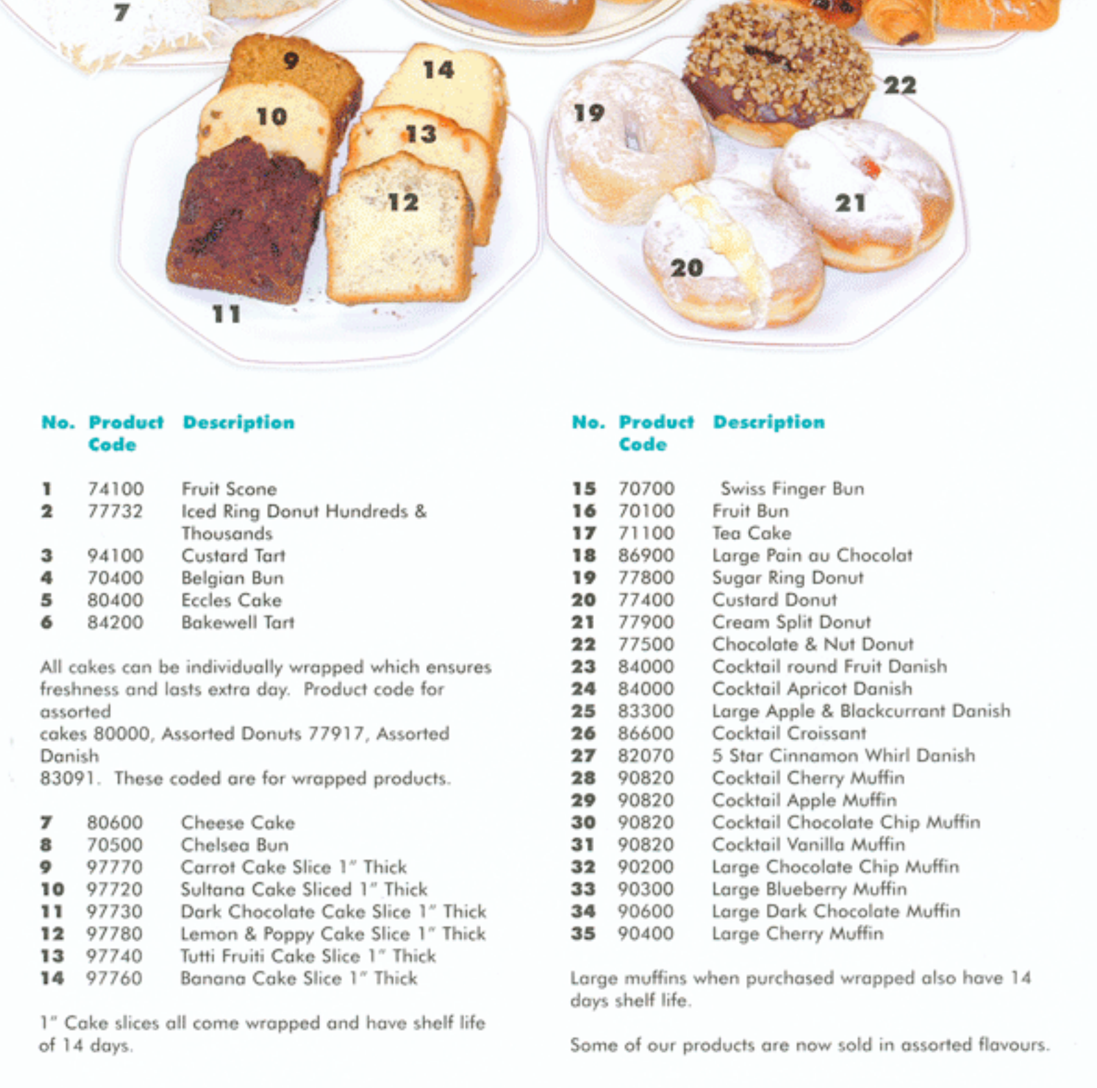
No. Product Description Code

Bread baked like your granny baked, packed full of flavour & goodness.