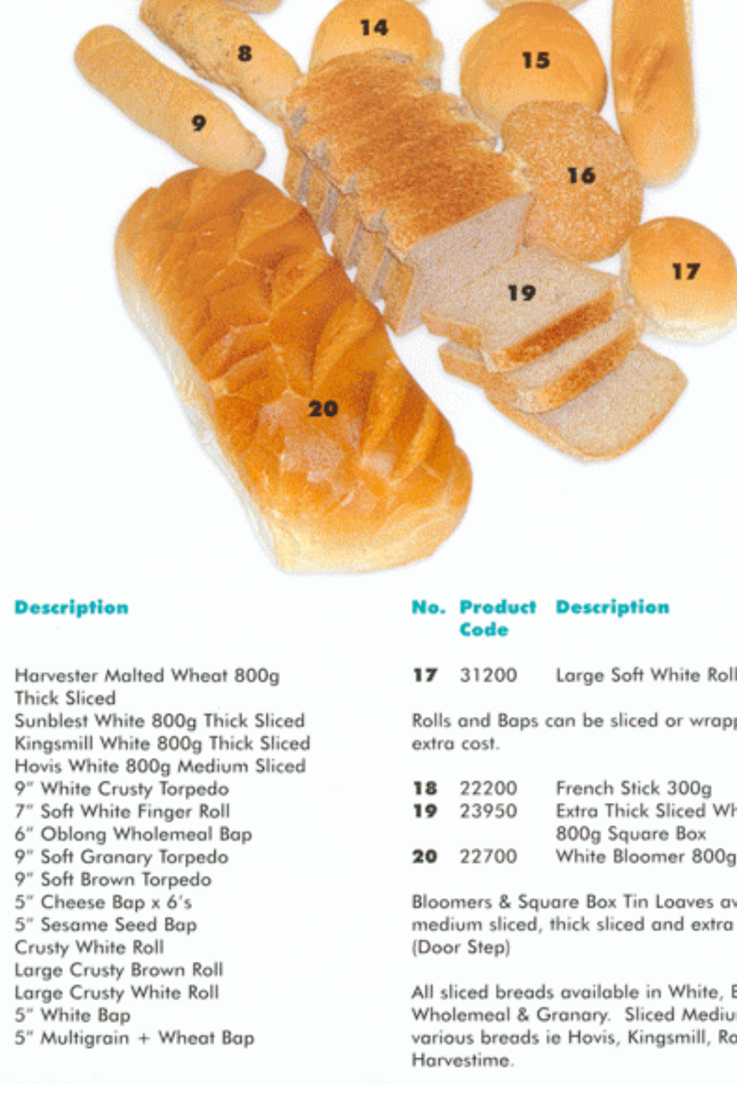
No. Product Description Code